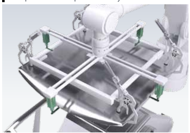
Welding jig workpiece clamp

Transport robot workpiece auxiliary holder