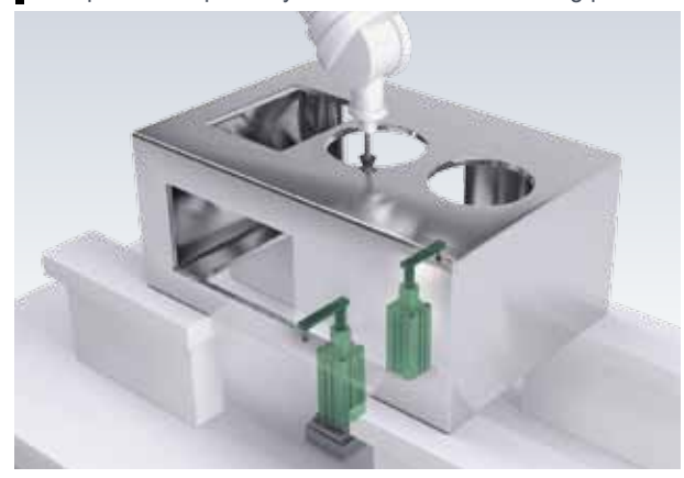
Workpiece clamp for dry burr removal and finishing process

Transport robot workpiece auxiliary holder