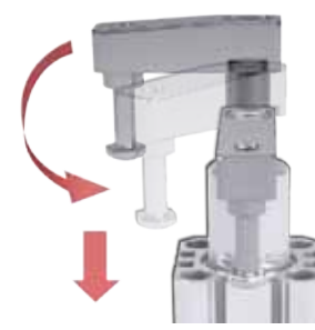
Rotate counterclockwise 90° (L: rotate to the left)