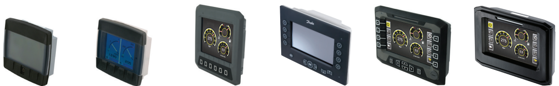
DP200 / DP211