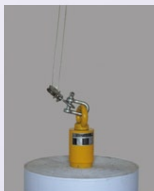
5. Set down, at slack rope automatic switch to releasing