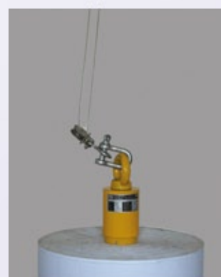
3. Set down, at slack rope, automatic switch to gripping