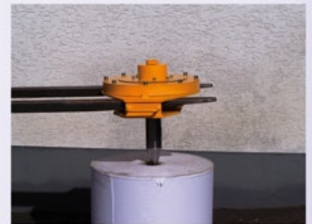
3. Inserting, self centering