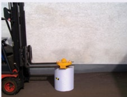
4. Set down, automatic switch to gripping