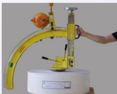
2. Set down