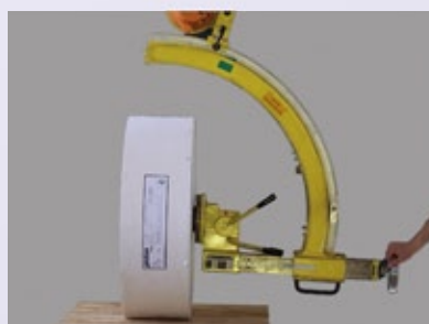
5. Set down