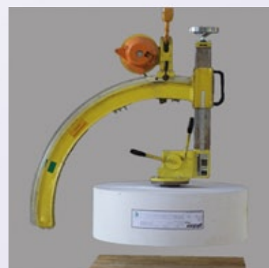
3. Lifting, gripping acts automatically